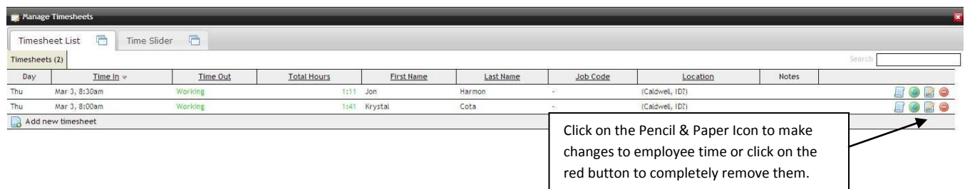
Figure 5. Timesheet List