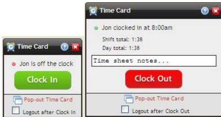
Figure 2. Time Card